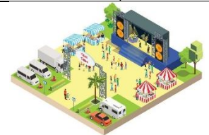
Music festival space