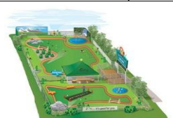
Dog off-leash park